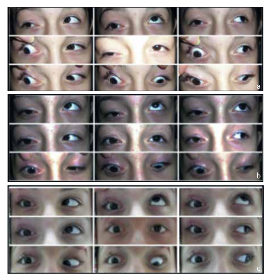
Fig. 3. Pre- and postoperative photographs of a patient with right oculomotor nerve palsy (case 10): A) before transposition surgery; B) at 1 month after surgery; C) at 12 months after surgery. Preoperative 45° right exotropia was improved to orthotropia after surgery. The ocular movements, including adduction, elevation, and depression remained restricted; restriction of abduction was –4

ensuing 5 weeks the sub-retinal fluid reabsorbed.